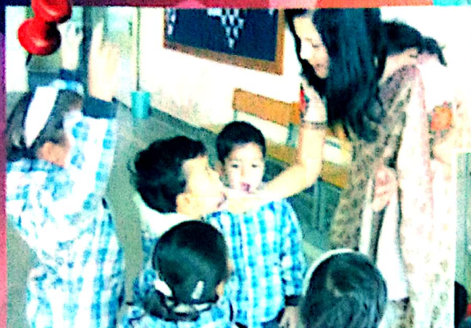
Love & Warmth in abounds