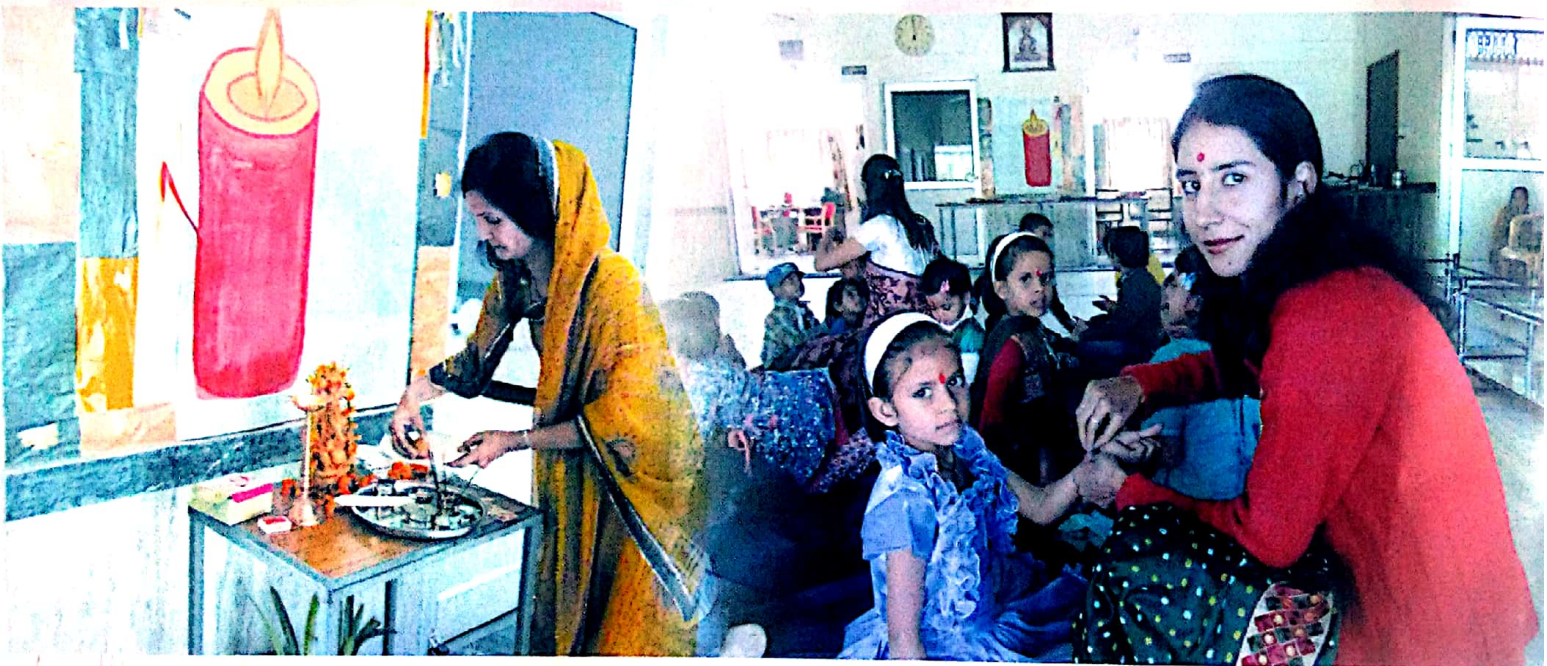
Invoking Lord Ganesha's Blessings