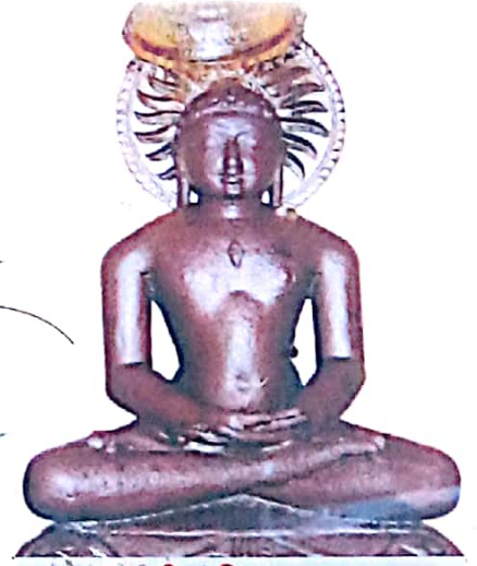
100% श्री आदिनाथ भगवान