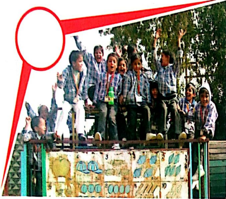
Children of Class KG and Prep in the Nature's lap - at the 'Mansarovar Technology Park'

Short trips and excursions are well integrated with the school curriculum. They not only break the monotony of class room study but also enhance the learning of the children in myriad ways.