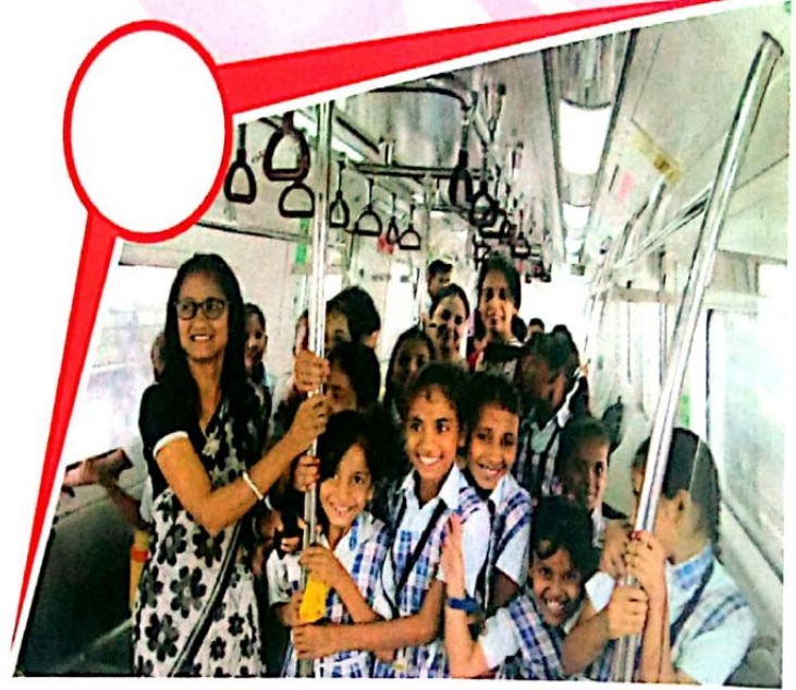
Students of Class IV-VII enjoying the 'Jaipur Metro' ride