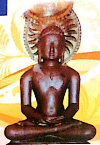
1008 श्री आदिनाथ भगवान