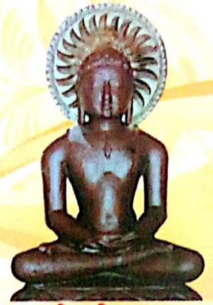
1008 श्री आदिनाथ भगवान

The function of education is to teach one to think intensively and critically. Intelligence plus character - that is the goal of true education.