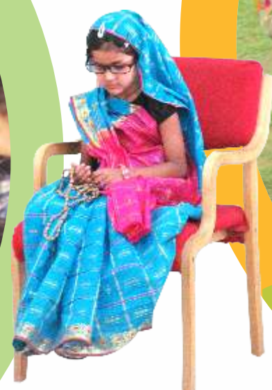
The Little 'Nani Maa'