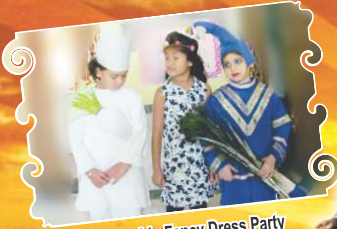
Life is one big Fancy Dress Party