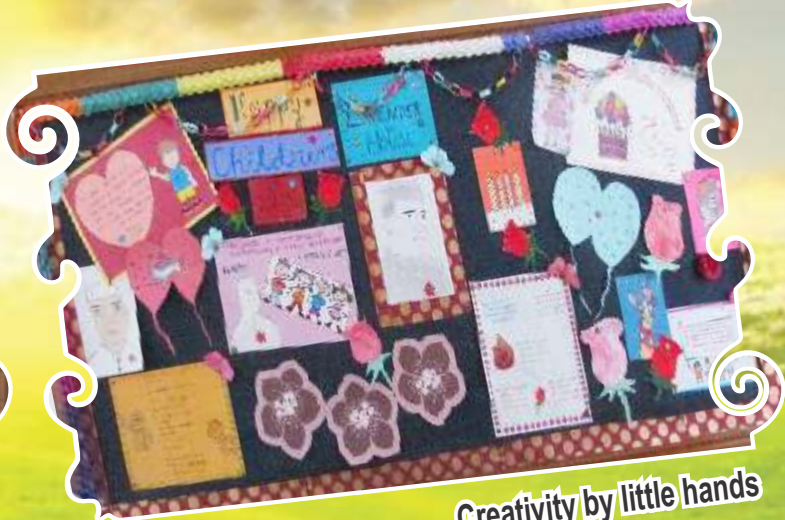
Creativity by little hands