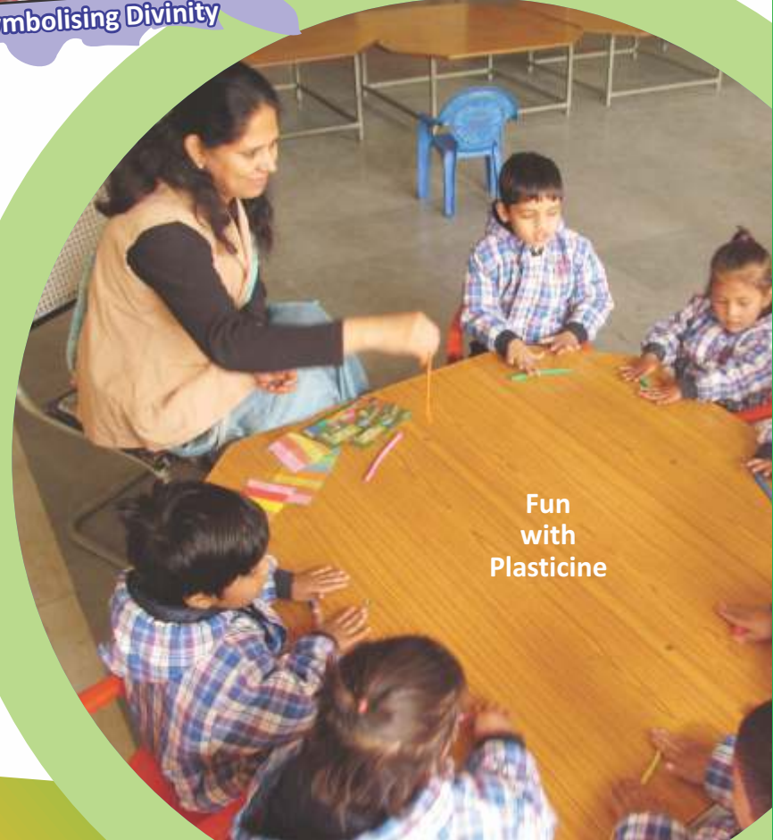
Fun with Plasticine