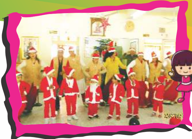
It's Jingle all the Way....