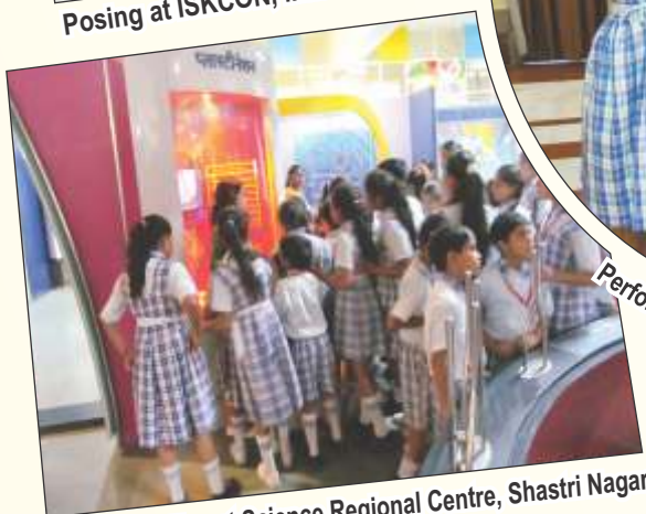
Learning & Fun at Science Regional Centre, Shastri Nagar