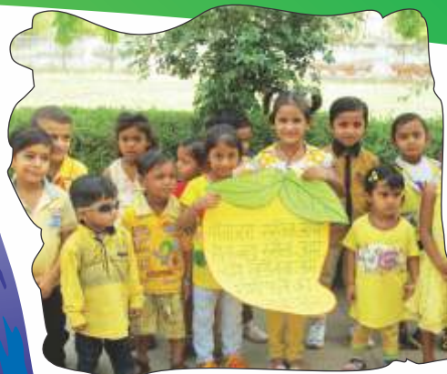
This is a mango.... YELLOW YELLOW MANGO