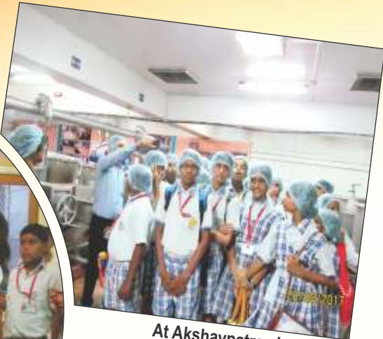
At Akshaypatra, Jagatpura