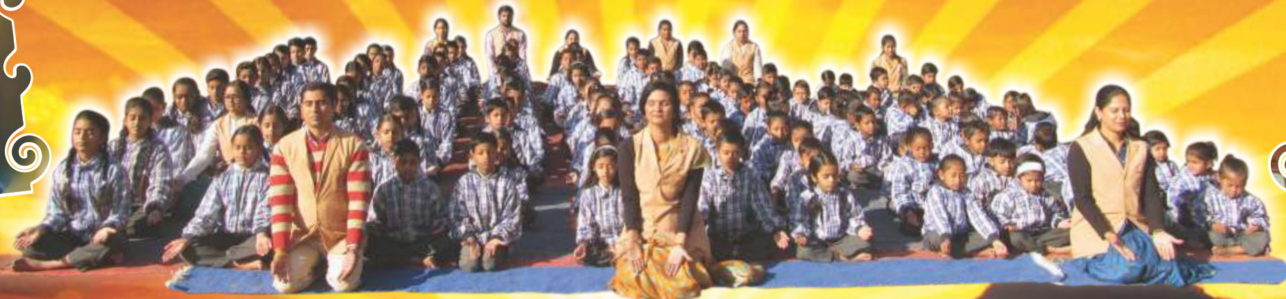
Morning Meditation & Exercise Beginning the day with positive energy and right frame of mind...