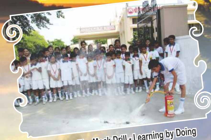
Fire Mock Drill - Learning by Doing