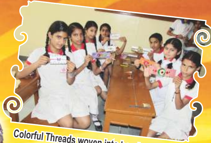
Colorful Threads woven into bonds of Love