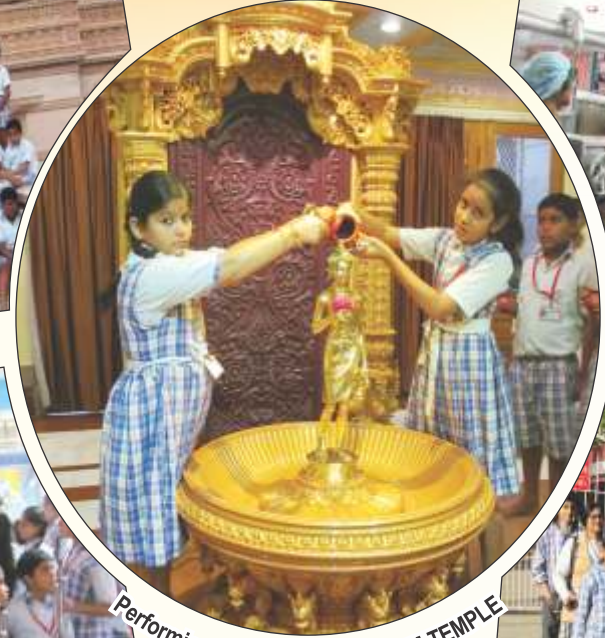
Performing Puja at AKSHARDHAM TEMPLE