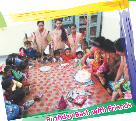
Birthday Bash with Friends