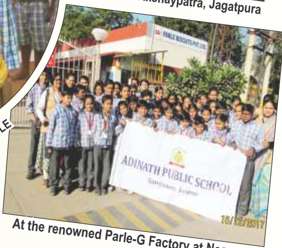
At the renowned Parle-G Factory at Neemrana