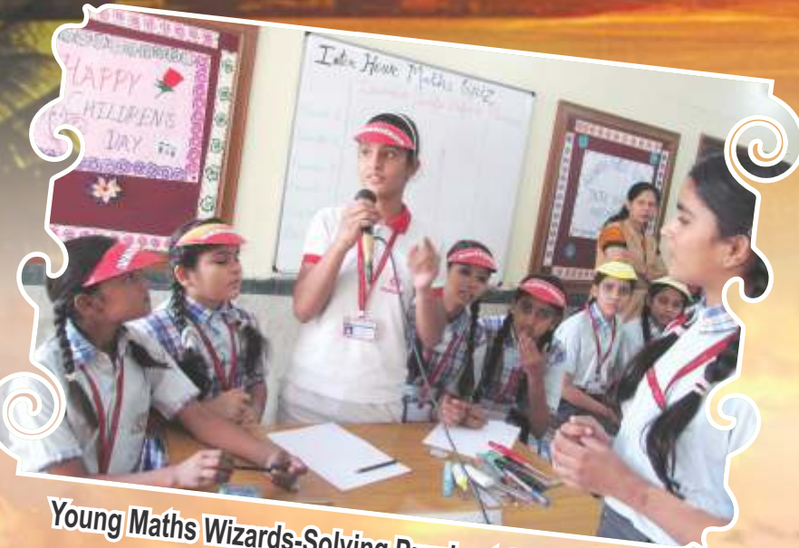
Young Maths Wizards-Solving Puzzle at Quiz Time