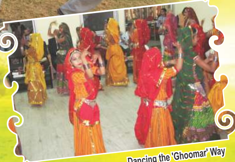
Dancing the 'Ghoomar' Way